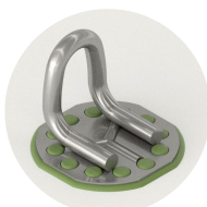
Surface bonding, closed loop

Alternative configurations may be possible using this product.