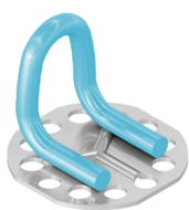
Closed loop fixing