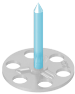
Pointed nail fixing