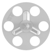
Perforated Head design