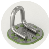
Surface bonding, closed loop

Alternative configurations may be possible using this product.