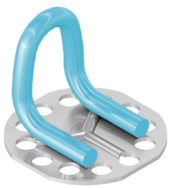
Closed loop fixing