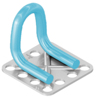
Closed loop fixing