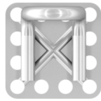
Perforated Head design