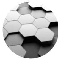
Carbon steel construction, bright zinc plate finish